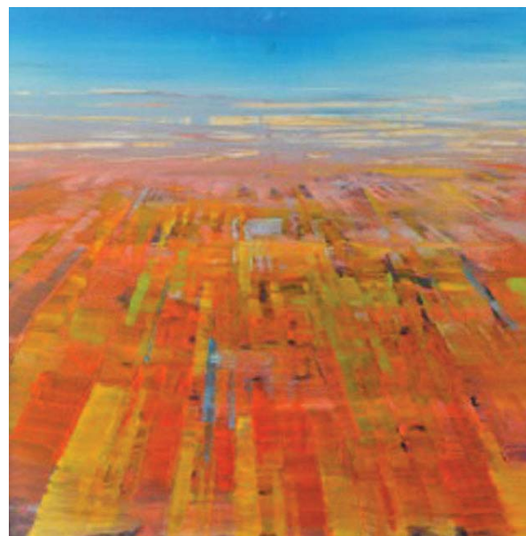
David Dunlop, "New Mexico Perspective," oil on anodized aluminum, 12 x 12

Fresh, new and different, Arroyo Wine Bar & Gallery is Telluride's hottest hybrid. Fine art and fine wine commingle in a sophisticated venue that is open late every night. Perfect for both special events and intimate gatherings, Arroyo features 100 carefully selected wines and spirits, regional charcuterie plates and the finest local desserts. Join them for apres-ski, before or after dinner or simply for quiet conversation in an upscale and welcoming environment. Located at 220 East Colorado Avenue in downtown Telluride; for more information visit www.arroyotelluride.com .